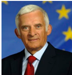
Jerzy Buzek Member and former President, European Parliament