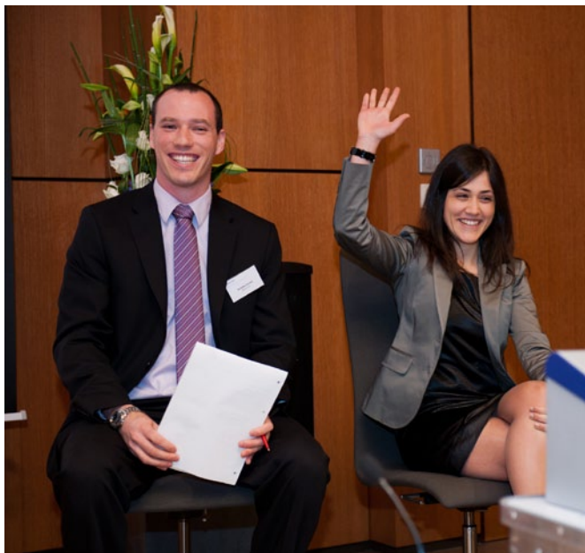
Finalists at the 2012 edition of the Academic Enterprise Awards

ACES draws nominations from all sectors, disciplines and countries in Europe, and are judged by the Science|Business Innovation Board, a leadership panel co-founded by Science|Business, business schools INSEAD and ESADE, in association with Microsoft and BP.